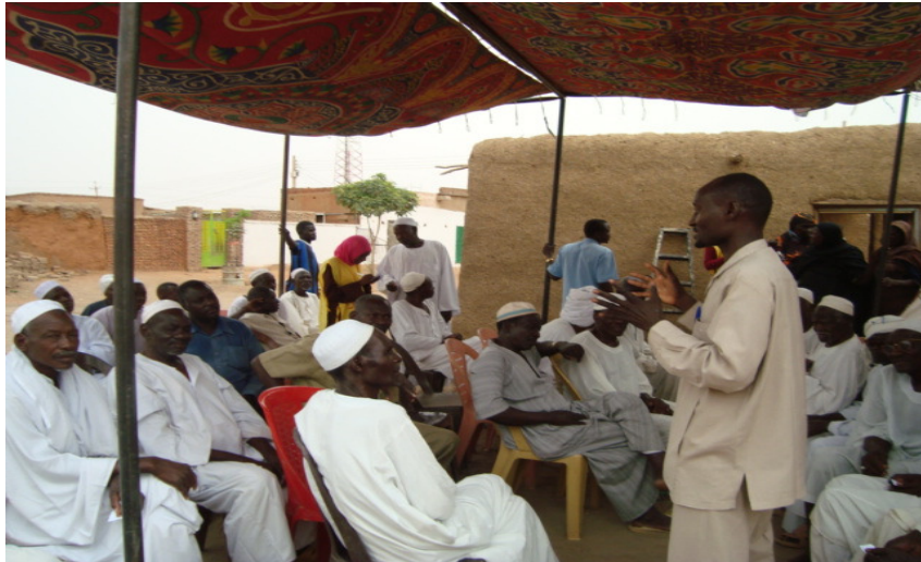
◀ A volunteer, carrying out hygiene and health education awareness training during the eye care outreach in Hai Albaraka, Haj Yousif.